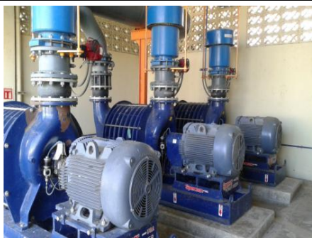
Blowers Ciudad Victoria WWTP