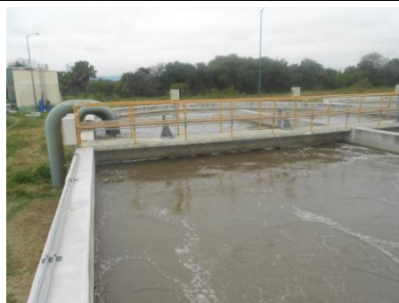
Ciudad Victoria WWTP