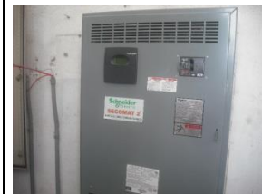
Electrical devices, Matamoros