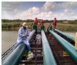
Water intake Rio Bravo