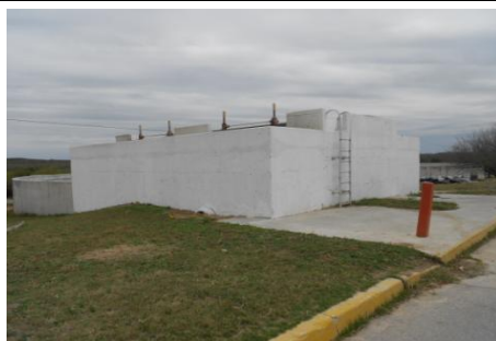
Nuevo Laredo water tank