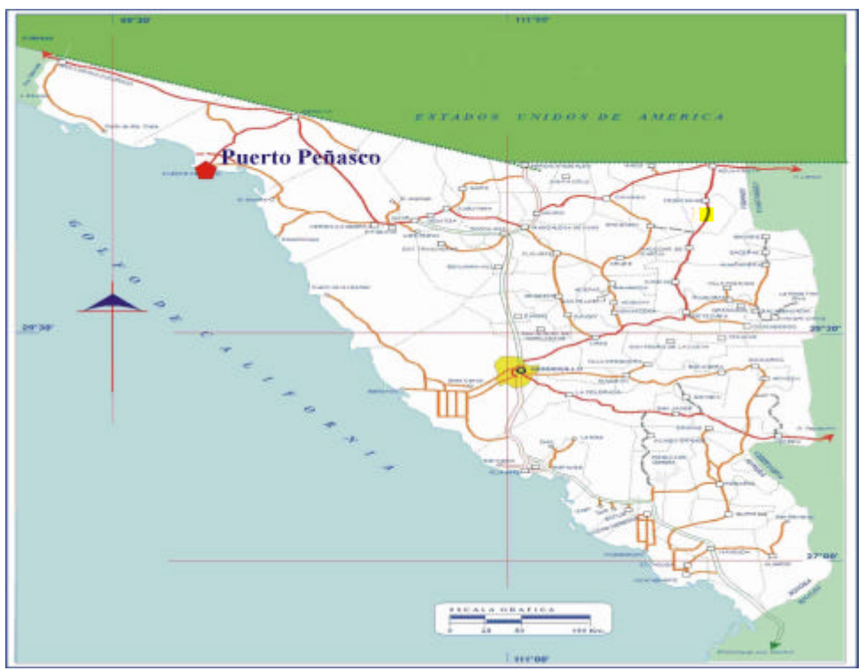
Figure 1. Puerto Peñasco, Sonora

The following table shows the information about the proposed streets. The project will be implemented in two years.