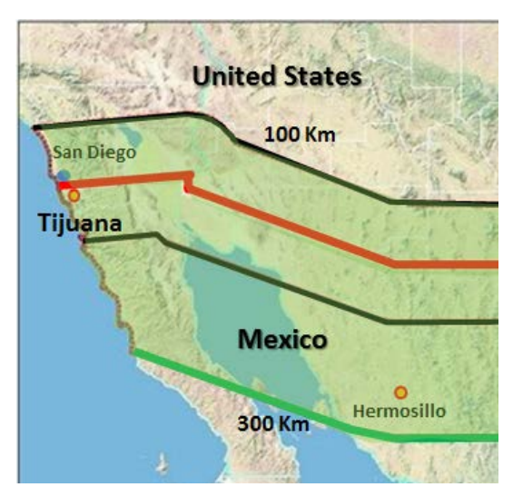
Figure 1 PROJECT LOCATION MAP