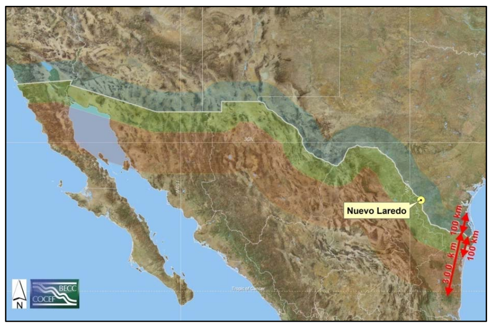
Figure 1. Location of the City of Nuevo Laredo in the State of Tamaulipas

Figure 1 shows the location of Nuevo Laredo, in the northeastern part of the State of Tamaulipas.