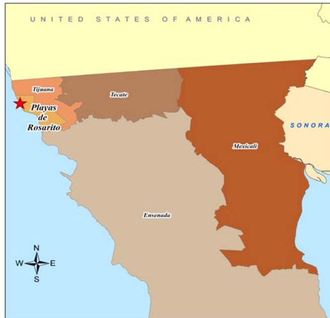
Figure 1.1 Playas de Rosarito, Baja California, México.