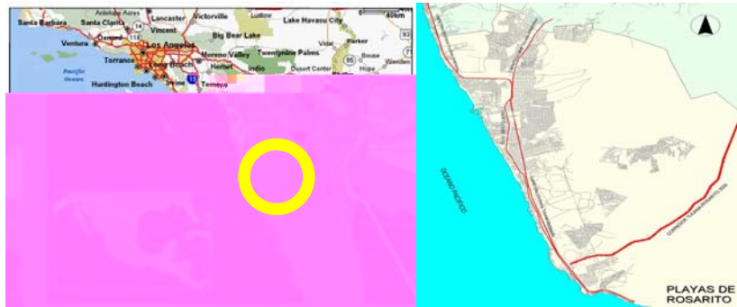
Location of Playas de Rosarito and Boulevard Siglo XXI

The city of Playas de Rosarito is located in the northeast of the State of Baja California, border to the north and east by the City of Tijuana, and is considered part of the metropolitan area. The project will be implemented in the city of Playas de Rosarito, which is located approximately 12.4 miles south of Tijuana. The project will benefit the eastern area of Playas de Rosarito including the City of Tijuana.