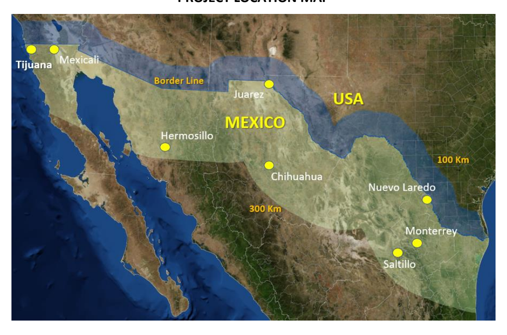
Figure 1 PROJECT LOCATION MAP

The Project will be implemented within the northern border region of Mexico, which encompasses the states of Baja California, Sonora, Chihuahua, Coahuila, Nuevo Leon and Tamaulipas. Figure 1 illustrates the geographical location of the 300-kilometer jurisdiction of NADB in Mexico.