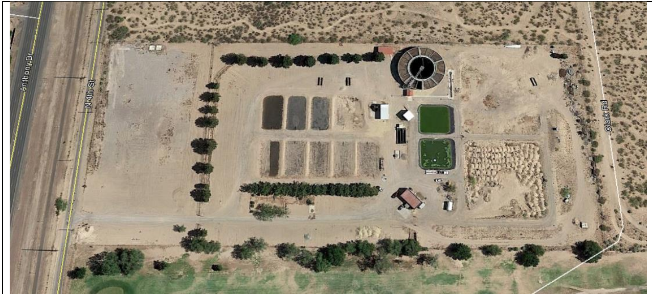
Aerial View of Plant