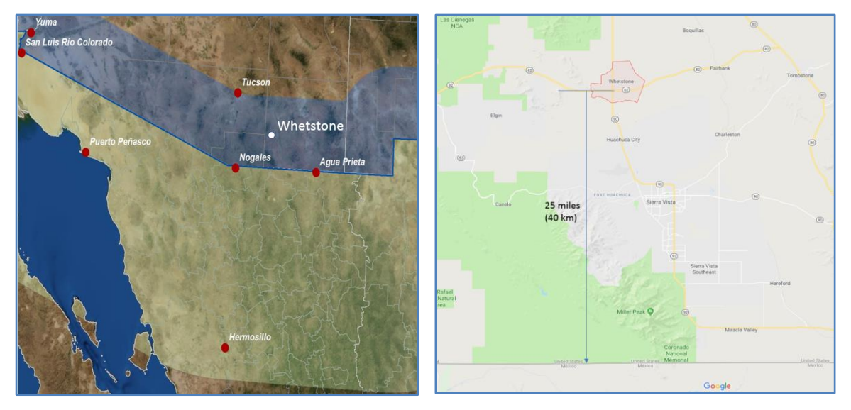
Figure 1 PROJECT LOCATION MAP