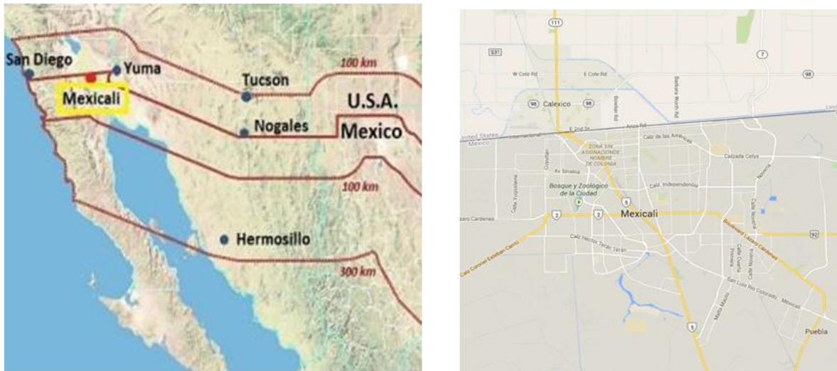
Figure 1 PROJECT LOCATION MAP