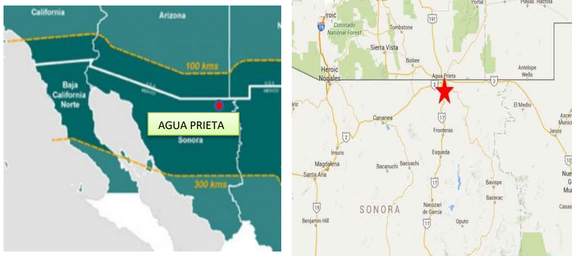
Figure 1 PROJECT LOCATION MAP