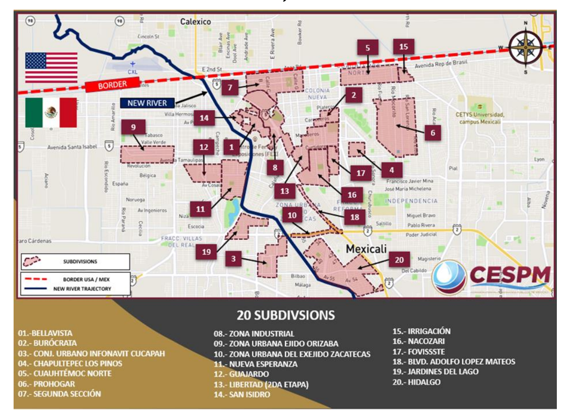
Figure 2 LOCATION OF PROJECT COMPONENTS

A grant from the Border Environment Infrastructure Fund (BEIF) is expected to supplement funding available from Mexico to support the necessary rehabilitation activities throughout the 20 subdivisions. Considering current cost estimates the BEIF funds are targeted to address infrastructure in Area 6, the Prohogar subdivision (14,616 ft. of 8-inch PVC pipe) and Area 20, the Hidalgo subdivision (1,280 ft. of 15-inch and 1,532 ft. of 16-inch PVC pipe). However, depending on the availability of funds, additional areas may be funded by BEIF.