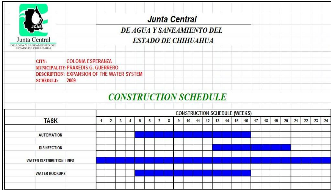
Figure 3 Construction schedule