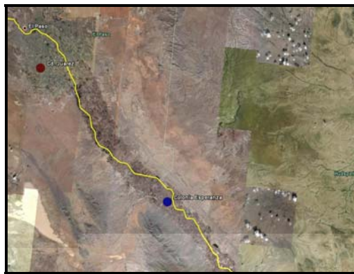
Figure 1. Location of Colonia Esperanza within the Municipality of Praxedis G. Guerrero.

Figure: Figure No. 1 shows the location of Colonia Esperanza, Municipality of Praxedis G. Guerrero, in northeast Chihuahua.