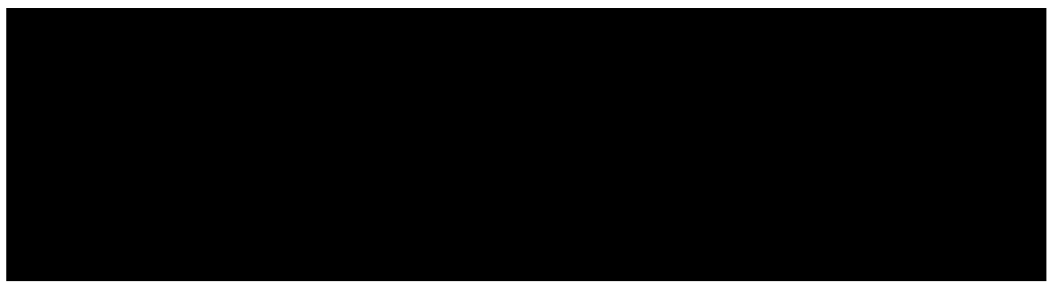
Figure 4. Construction Schedule for the Hermosillo WWTP.

Once the BOT Contract is awarded, there will be a 30-month timeframe for the development of final designs, construction, start-up, and stabilization, and a 234 month timeframe for the operation.