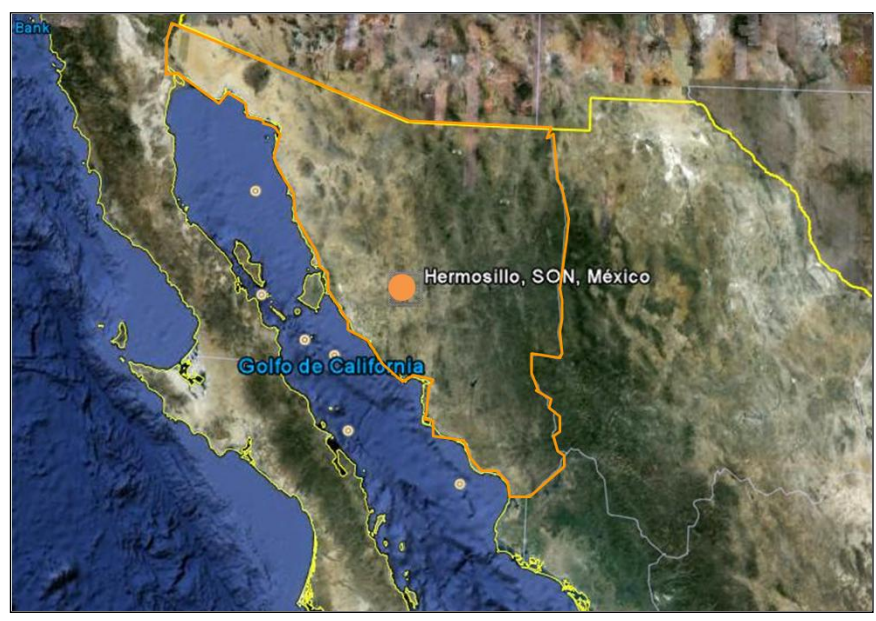
Figure 1. Location of Hermosillo in the State of Sonora

Figure: Within the 300 km (186 mi) border area.