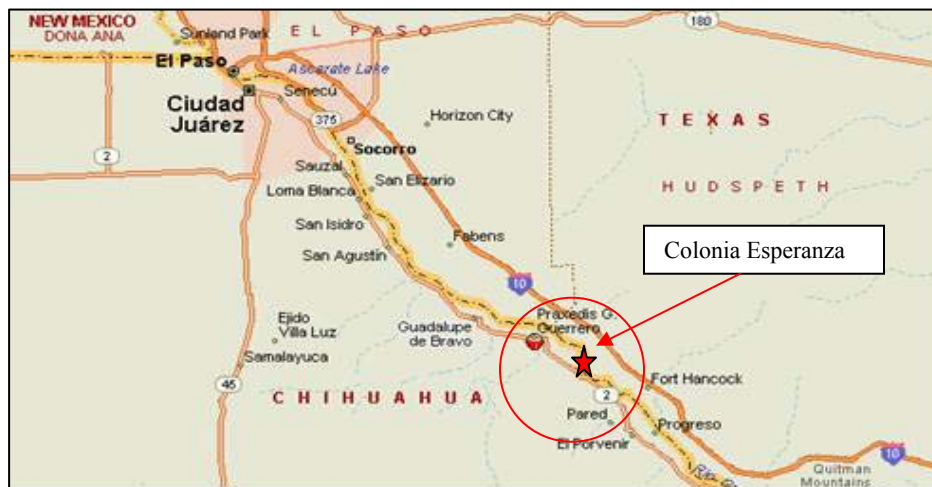
Figure 1. Location of Colonia Esperanza, Municipality of Praxedis G. Guerrero.

Figure No. 1 shows the location of Colonia Esperanza, Municipality of Praxedis G. Guerrero.