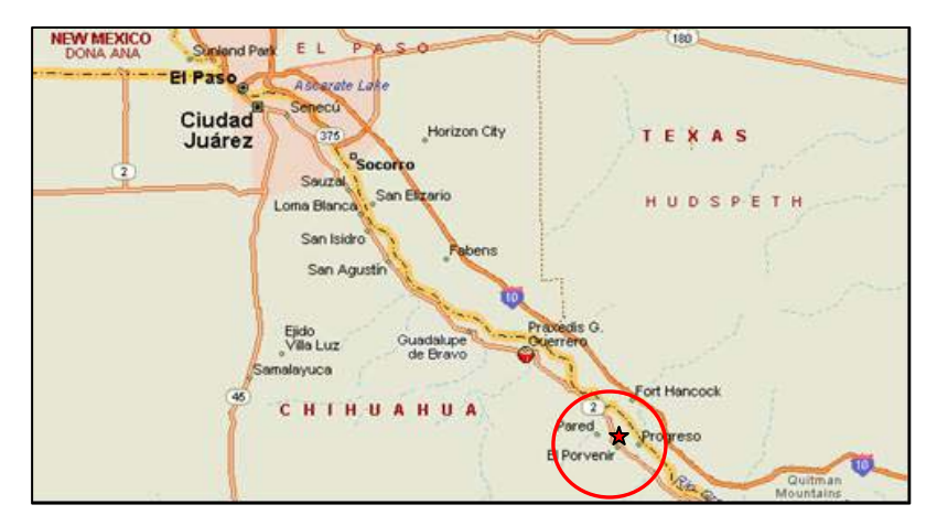
Figure 1. Location of El Porvenir, Municipality of Praxedis G. Guerrero

Figure 1 shows the location of El Porvenir, Municipality of Praxedis G. Guerrero, in the northern end of the state of Chihuahua.