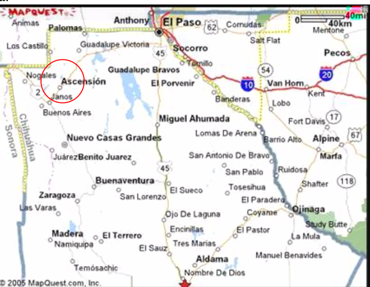
Figure 1 shows the location of Ascensión, in the northern part of the state of Chihuahua.

The state of Chihuahua is located on northern part of the Republic of México, bordering the United States of America (USA). The city of Ascensión, Chihuahua is located in the northwest part of the state,18.5 miles from the US-Mexico border and approximately 117 miles from Cd. Juarez, Chihuahua.